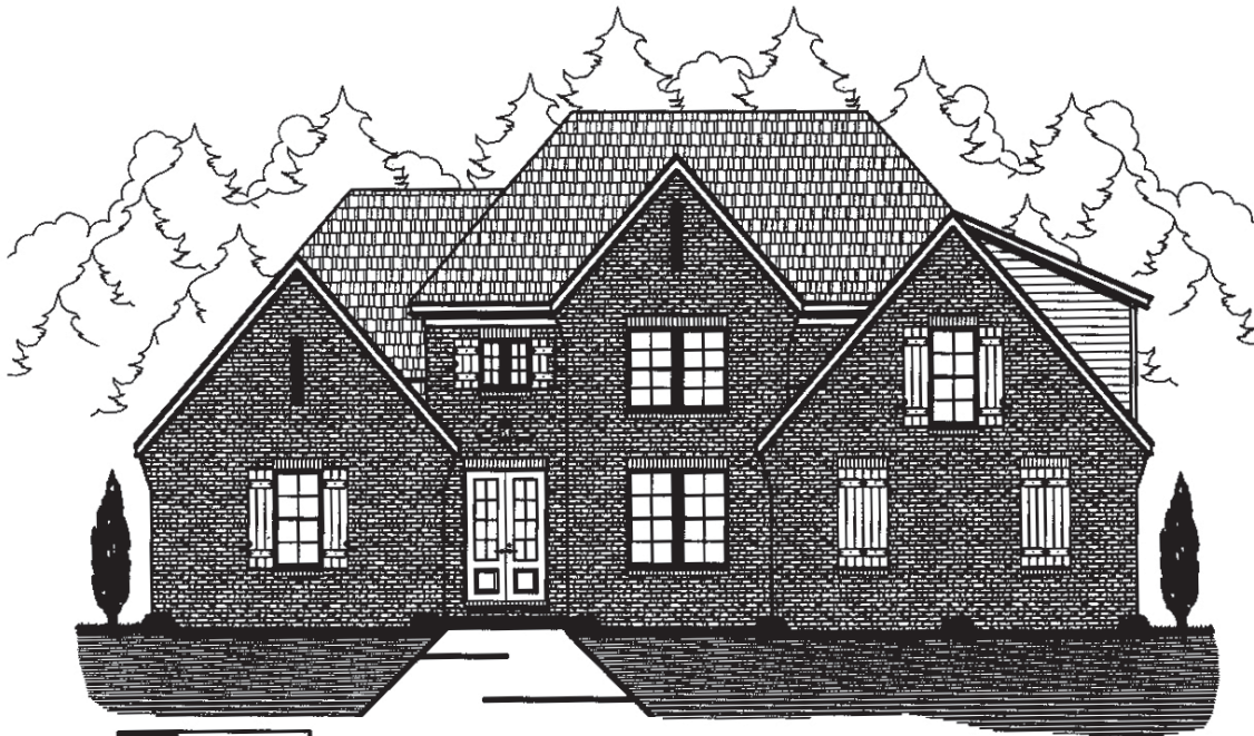
The "Oak" Collierville, TN 38017